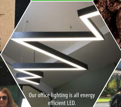
Our office lighting is all energy efficient LED.