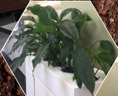
Some of our indoor planters.