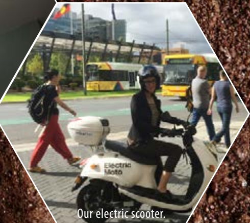
Our electric scooter.