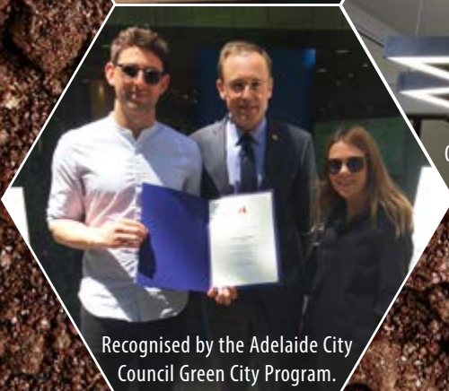
Recognised by the Adelaide City Council Green City Program.