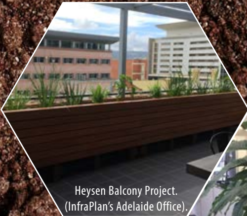
Heysen Balcony Project. (InfraPlan's Adelaide Office).