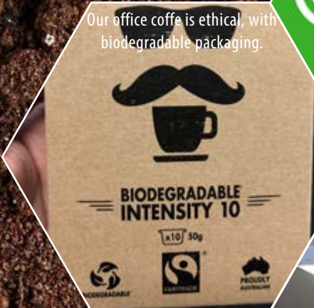
Our office coffee is ethical, with biodegradable packaging.